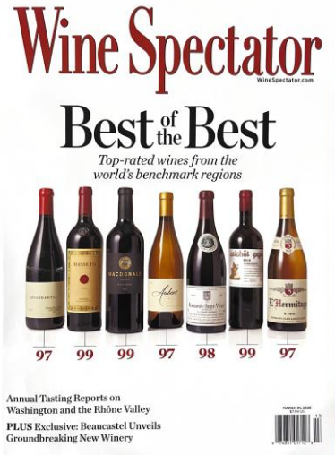
Domaine de Beurenard is in the worldwide selection "Best of the Best"