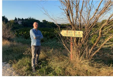
Decanter's Rhône correspondent, Matt Walls, at Château Rages.

"Beaurenard est le maître des Châteauneuf blancs." Matt Walls Decanter, My top 10 wines of 2024 January 2025